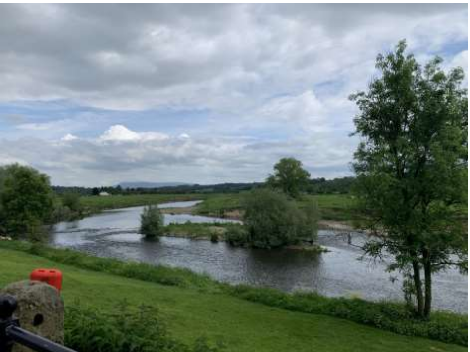
Year 3's picnic view

This trip could not have taken place without your monetary contributions so we thank the Year 3 parents for their wonderful support and timely payments.